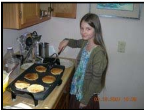
Pancake preparation.