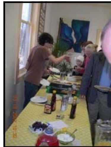
Pancake feasting.